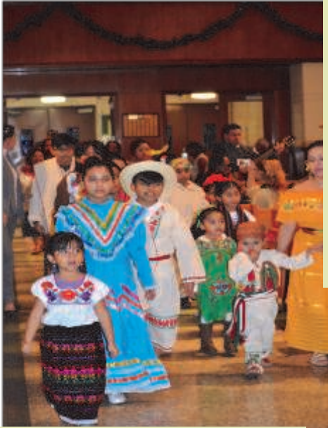
Saint Nicholas of Tolentine Parishioners Celebrating Our Lady of Guadalupe