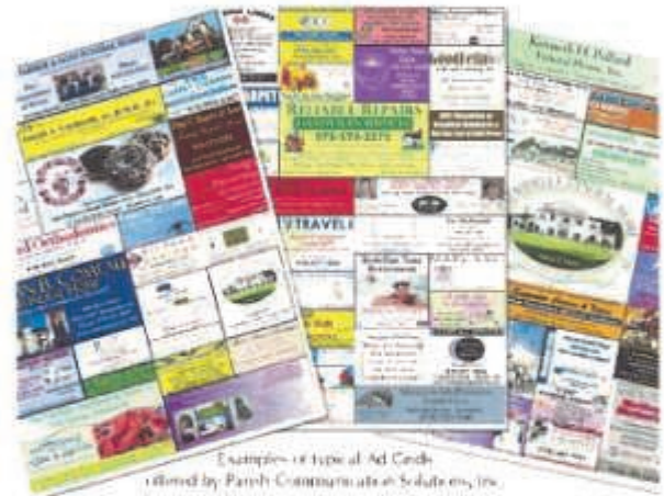
Example of type of Ad Grid offered by Parish Communications Solutions, Inc.

Contact The Church Bulletin Inc. Phone: 631-249-4994